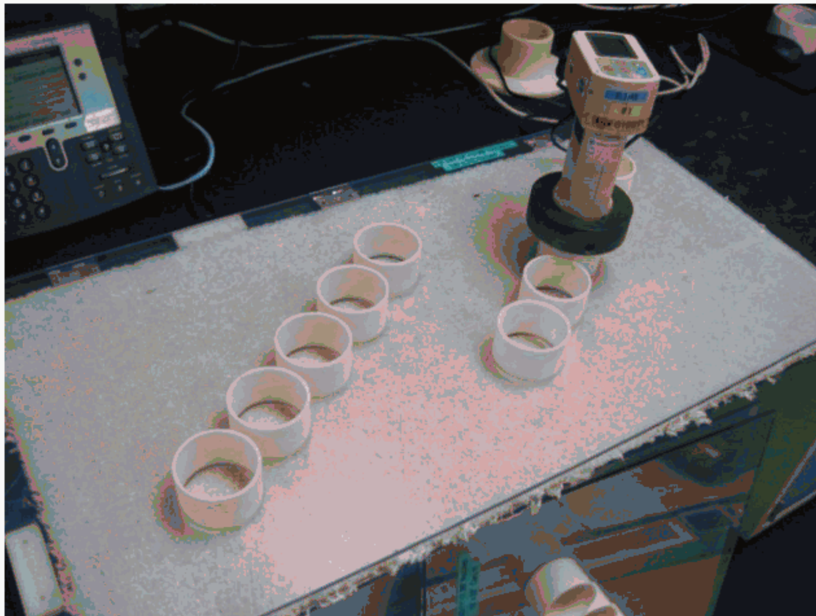
Figure 2 – Carpet grooming tool with weight