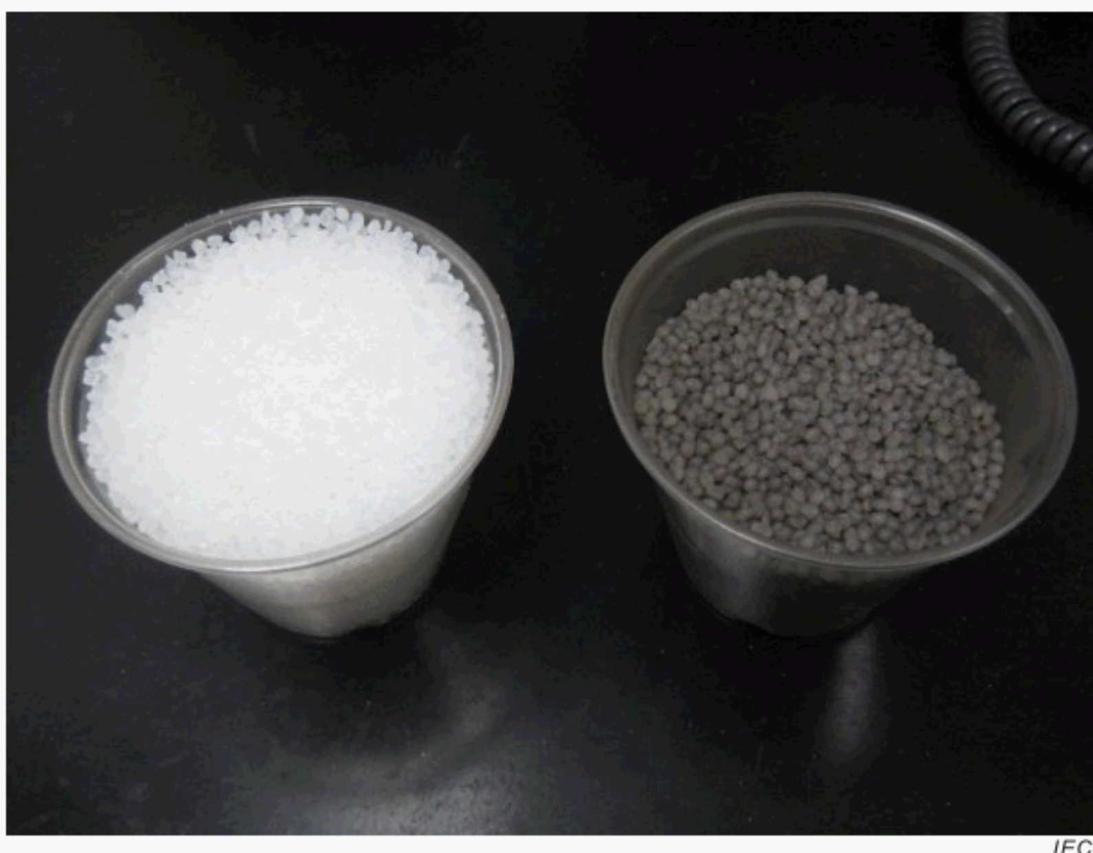
Figure 1 – Polymer pellets – Unsoiled vs. soiled

5.2.1.3.2 Polymer pellets (nylon) are soiled using a pellet soiling cylinder rotated a prescribed number of minutes in each of two directions. A prescribed ratio in grams of pellets to grams of AATCC TM122 synthetic soil is used to effectively transfer the soil to the pellets. (See 7.2.1 for AATCC TM122 soil specification and the example of unsoiled and soiled pellets in Figure 1.)