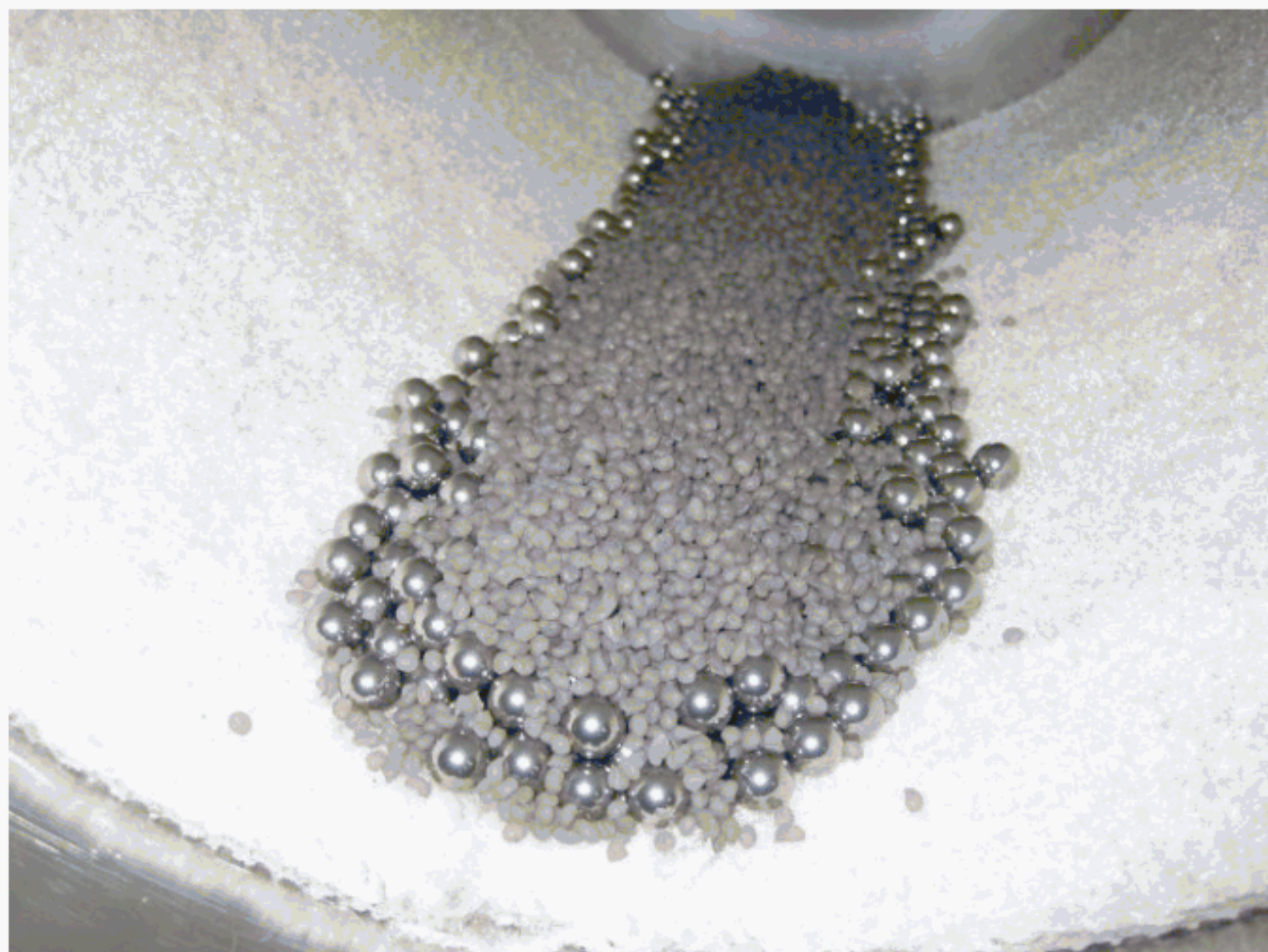
a) Carpet soiling cylinder